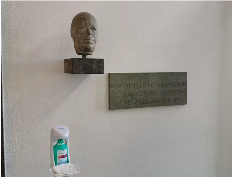
Bührle bust in the new building from 1958 (financed by Bührle).