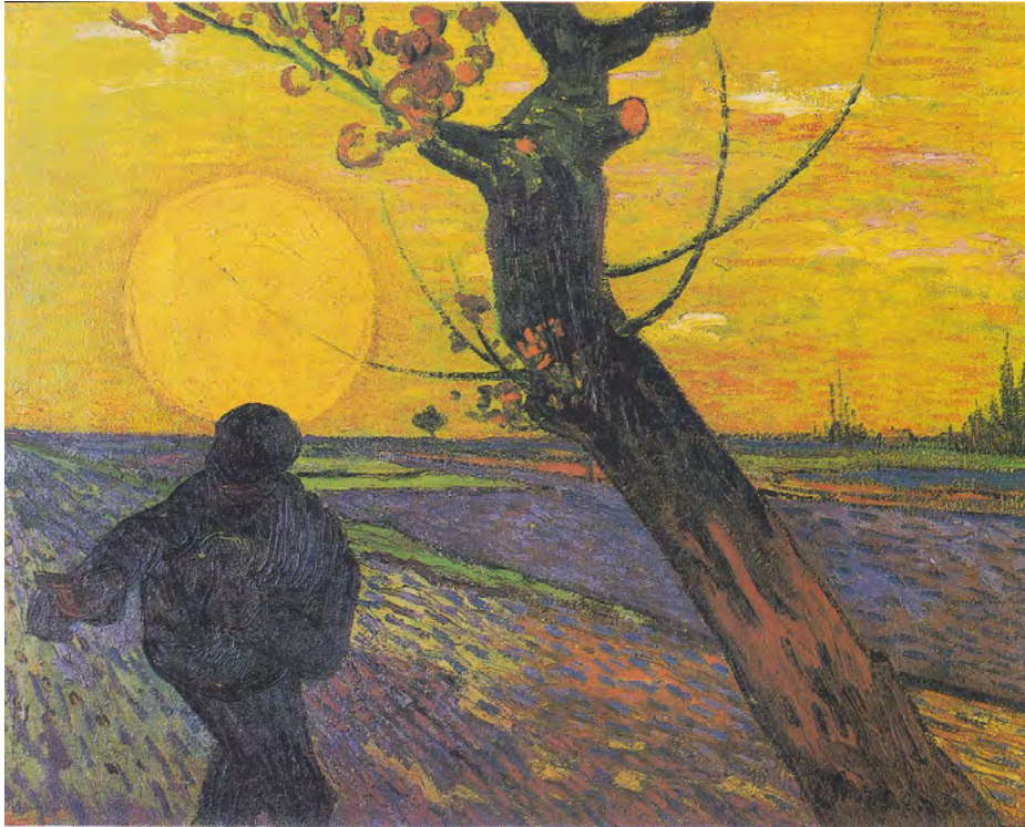
Sower at Sunset , Vincent van Gogh, 1888. Emil Bührle's Collection.

wallflower existence on the outskirts of Zurich. At the dawn of the 21 st century, there was still no end in sight to this untroubled state of affairs.