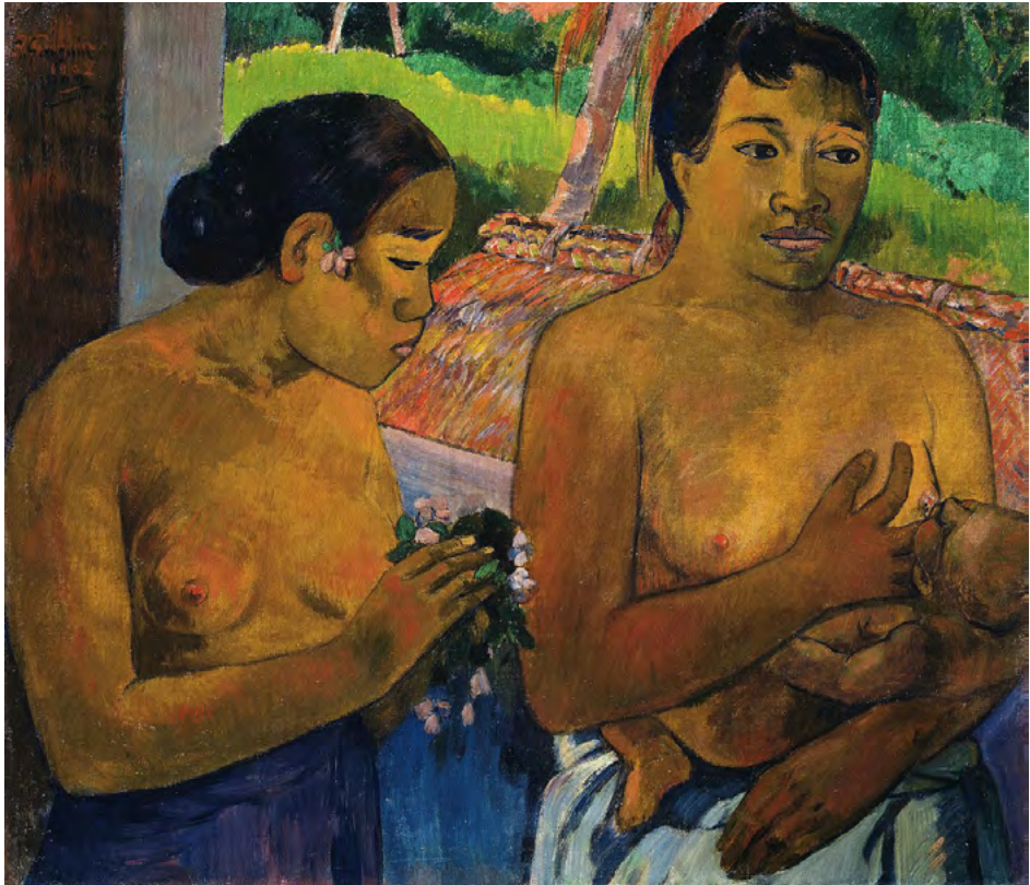
The Offering , Paul Gauguin, 1902. Emil Bührle's Collection.