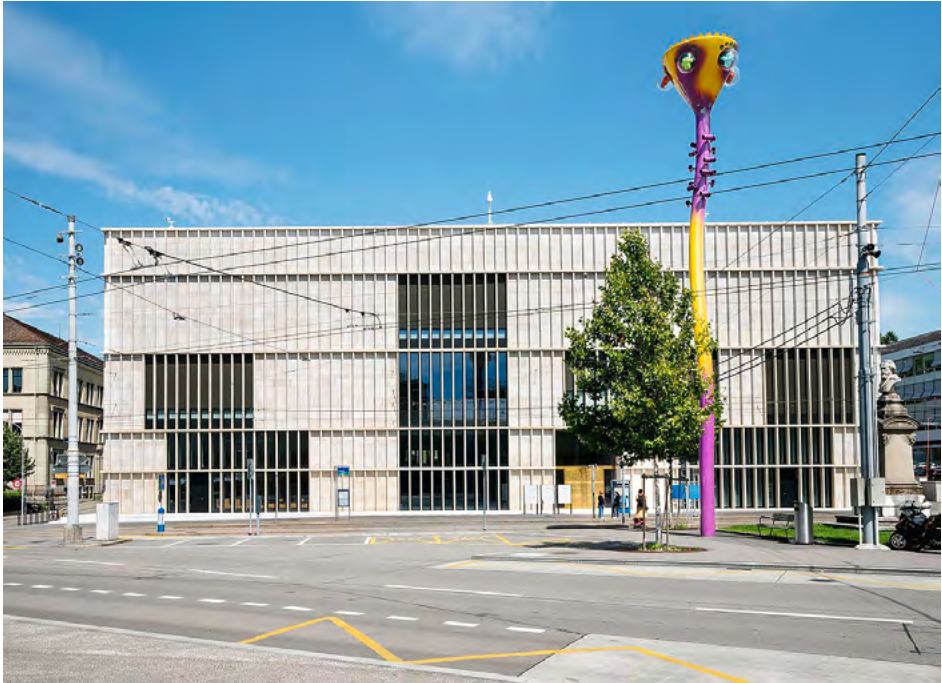
Kunsthaus Zurich Chipperfield Building, Zurich.

Kunsthaus Zürich MarKom (via Wikimedia Commons)