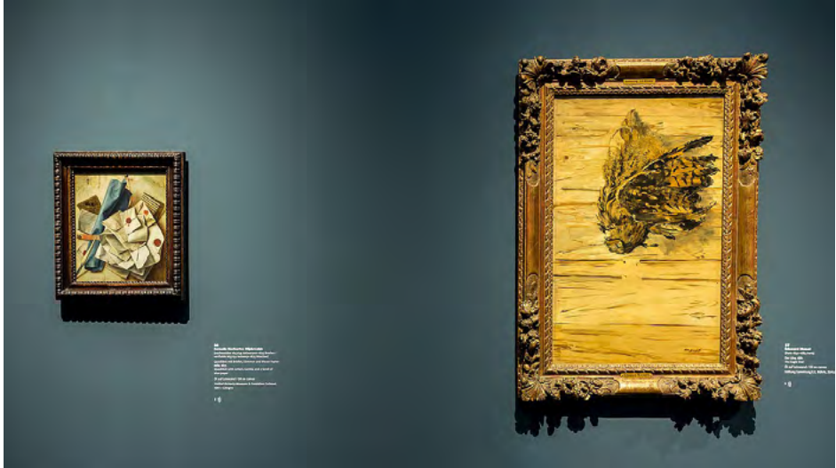
Special exhibition at Museum Wallraf-Richartz: “Von Dürer bis Van Gogh-Sammlung Bührle trifft Wallraf (From Dürer to van Gogh – the Bührle Collection meets Wallraf).”

the art world, but a whole raft of problems that permeated and caused multiple shocks within the art world.